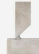
Metal-cored wire with SpeedArc