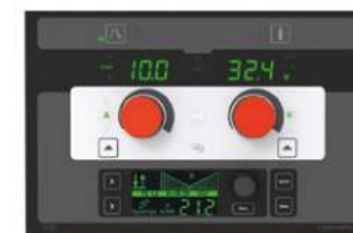
ControlPro control panel

As few as 3 steps will lead to the perfect welding result.