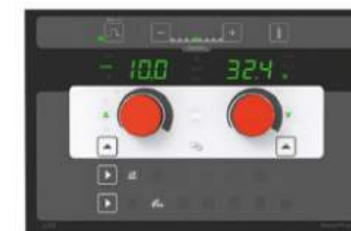
BasicPlus control panel

Choose between two operating concepts: clear introductory or practical comfort operation with a graphical display and job store facility.